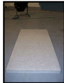
Ear Controlled Data

The sample was identified as Polyester Acoustic Panel. The sample was received in 24" x 48" x 2" nominal sections (9 sections received). The exposed area was a total of 72 ft2 and weighed 57.6 lbs.